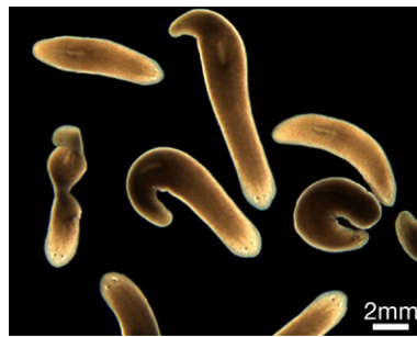
Figure 1. A Raid of Planarians

There are thousands of different planarian species, but only several dozen have been characterized in some detail. Of these, the free-living freshwater hermaphrodite Schmidtea mediterranea has emerged as a suitable model system because it displays